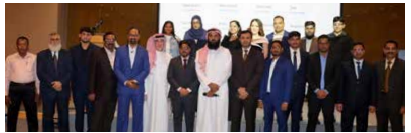
Management and staff of Global Travel

With a wide array of offerings, including 450 airlines, 387,000 hotel properties, and partnerships with top travel insurance companies, Global Travel's website, www.globaltravelbh.com provides clients with competitive prices, easy booking, and convenient payment options. As the only OTA mobile app in Bahrain, Global Travel is dedicated to making travel easier for customers and travel agents alike. As the world emerges from the challenges of the past, Global Travel is poised to lead the way in shaping the future of travel, with a positive outlook for 2024 and beyond.