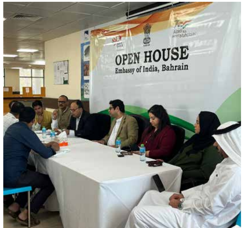
A monthly open house at the Indian Embassy

houses that have been held once a month, but also when I look at the overall picture of the diaspora in Bahrain, I split it into parts: rules as well as responsibility. When we look at the rules, I would say that in the way in which they have conducted themselves, in the way in which they have contributed to the economic prosperity of Bahrain, and in the way in which they have acted as a bridge between the two societies, they have done an exemplary job. While doing that, they have carried out what are essential requirements in any ordered society, which is that they followed the laws and rules of Bahrain. I’m very happy to stay that overall the Indian community has lived as good guests to an excellent host, which is the leadership and the government of the people, and it is my hope that during my tenure the cooperation between the two societies will be strengthened as a result of the positive contribution