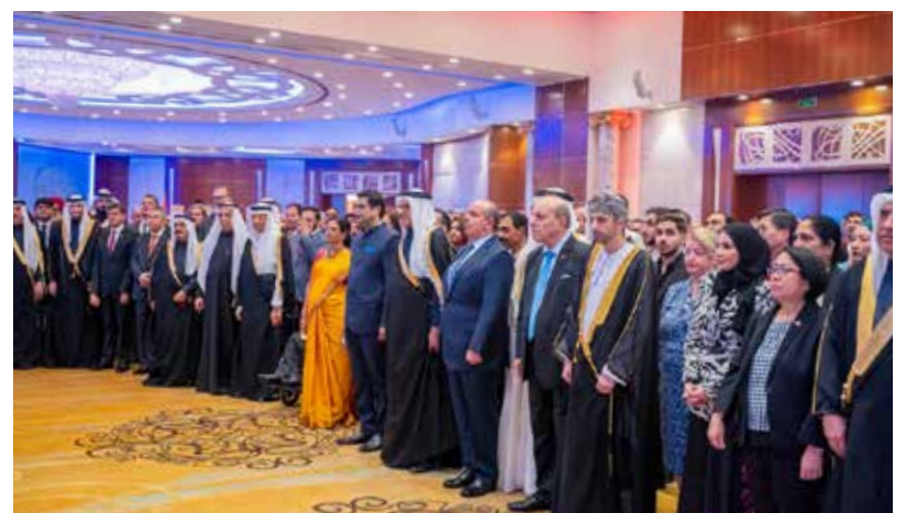
Guests at the Republic Day reception